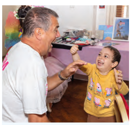
Bring creativity and colour to young patients and their families through art activities and child-focused art workshops in hospitals