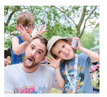
Bring smiles to the faces of seriously ill and hospitalised children through in-person and virtual visits through our team of professional entertainers