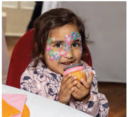
Engage and entertain the whole family through joyful trips, activities and parties